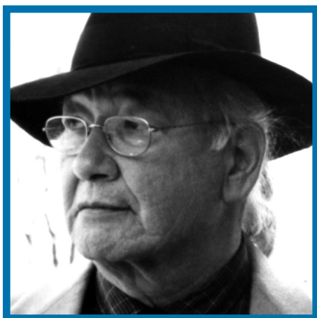
N. SCOTT MOMADAY