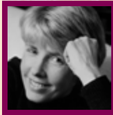
Dr. Kay Redfield Jamison "An Unquiet Mind: Personal & Professional Reflections on Mental Illness"