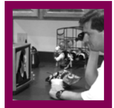
A distance learning experience comes very easily to most students and provides much-needed scheduling flexibility.

She sums it up this way: “Good teaching is good teaching. In any medium. The more options you have to get that teaching to students, the better.”