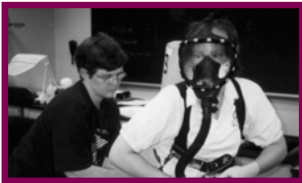
Part of the reason the suit is so large is that the wearer has a self-contained air canister on their back.