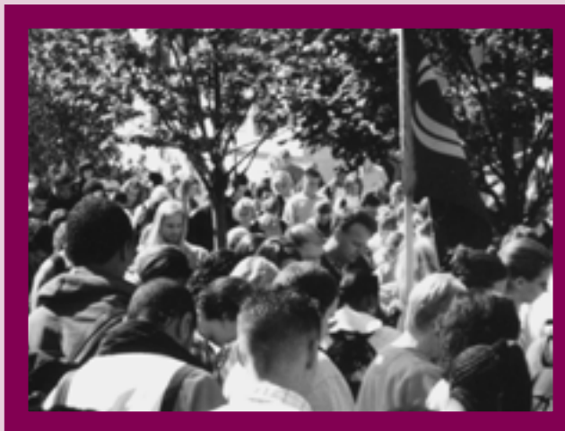
The people of GRCC responded quickly in many ways to the September 11 tragedies, raising money, donating blood and, in this case, simply coming together for prayer and reflection on Bostwick Commons.