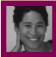
Rebecca Walker "Bi-Racial Children and Families"